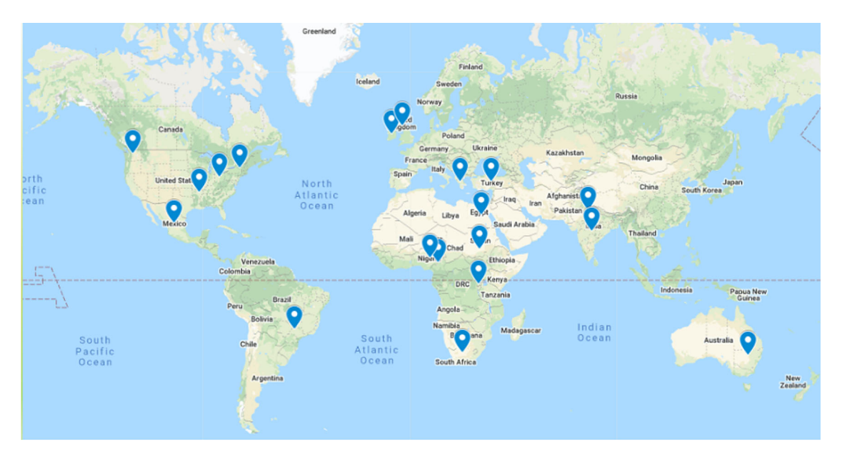
Figure 1. Locations of Bioinformatics Open Source Conference participants who received free registration to Intelligent Systems for Molecular Biology/European Conference on Computational Biology 2021.

Thanks to our sponsors, we were able to grant free registration to everyone who asked for assistance, a total of 20 people from around the world (see Figure 1), not including organizing committee members and gold/platinum sponsor representatives whose registration fees were also paid for. You can read blog posts by some of the OBF/BOSC Event Fellowship Awardees on our website: https://www.open-bio.org/blog/.