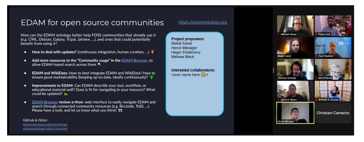
Figure 11. CoFest participants work to make EDAM even more useful to the broader community.