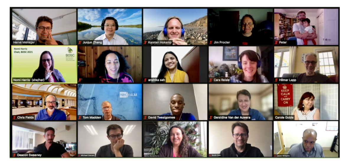
Figure 10. The final BOSC 2021 online "happy hour".