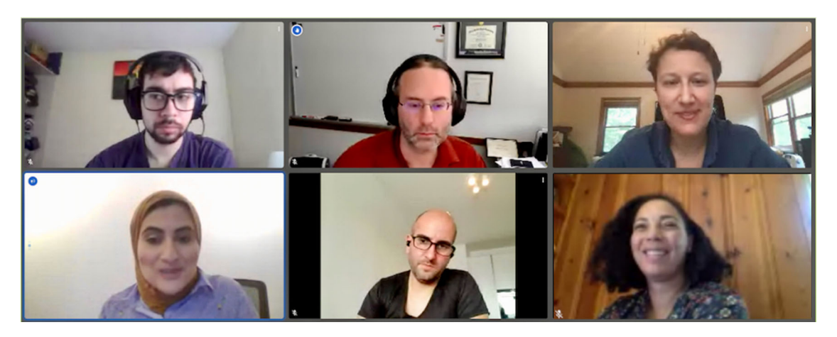
Figure 9. Some of the attendees at one of the 2021 Birds of a Feather sessions.