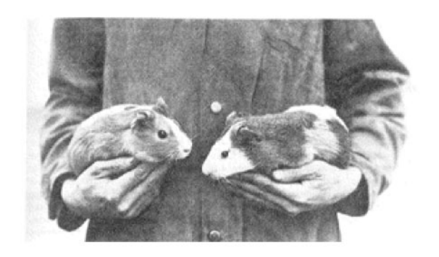
Sewall Wright holding a guinea pig in each hand circa 1920.