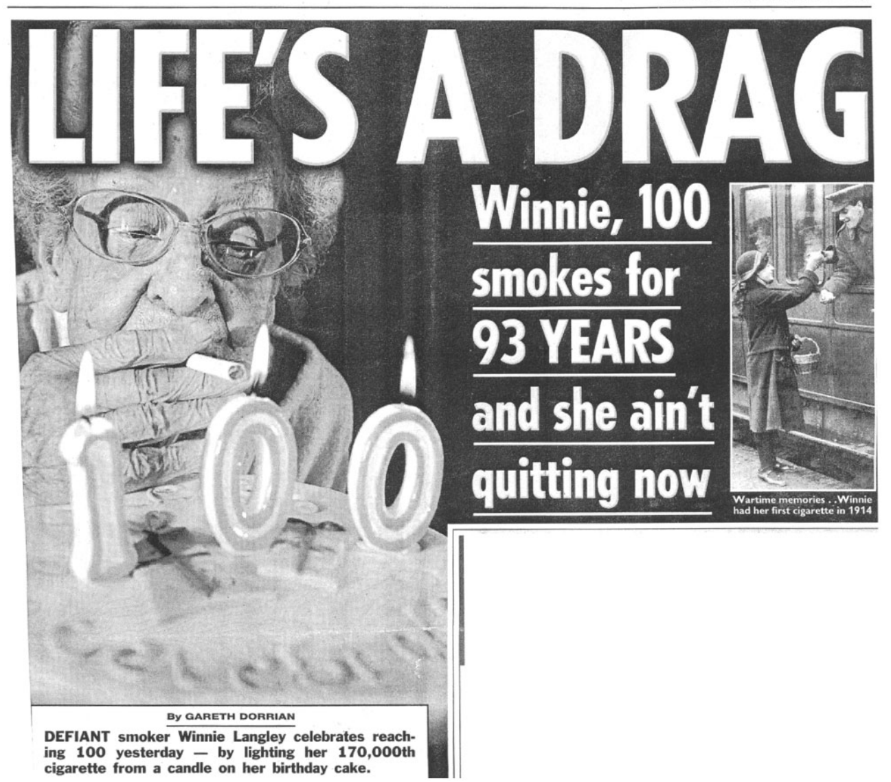
Figure 1 Winnie ain't quitting now

living, loom large in the popular imagination<sup>2</sup> and are reflected in the low positive predictive values and C statistics in many formal epidemiological prediction models. In general, epidemiologists do a rather poor job of predicting who is and who is not going to develop disease.