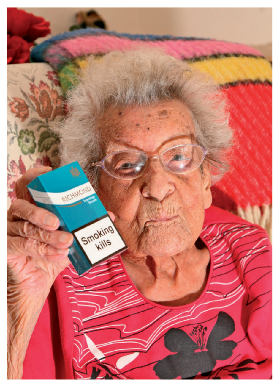
Figure 7 Winnie: the tail of a distribution or a 'black swan'?

population and variations over time or between populations—can be found in the writings of such disparate figures as R.A. Fisher, <sup>152</sup> Sewall Wright <sup>153,154</sup> and Richard Lewontin, <sup>155</sup> although with greatly varying emphasis. Epidemiologists and other population health scientists have drawn out the implications of this well-established and non-controversial insight in ways that link it with classical epidemiological reasoning (Box 5). <sup>156–158</sup>