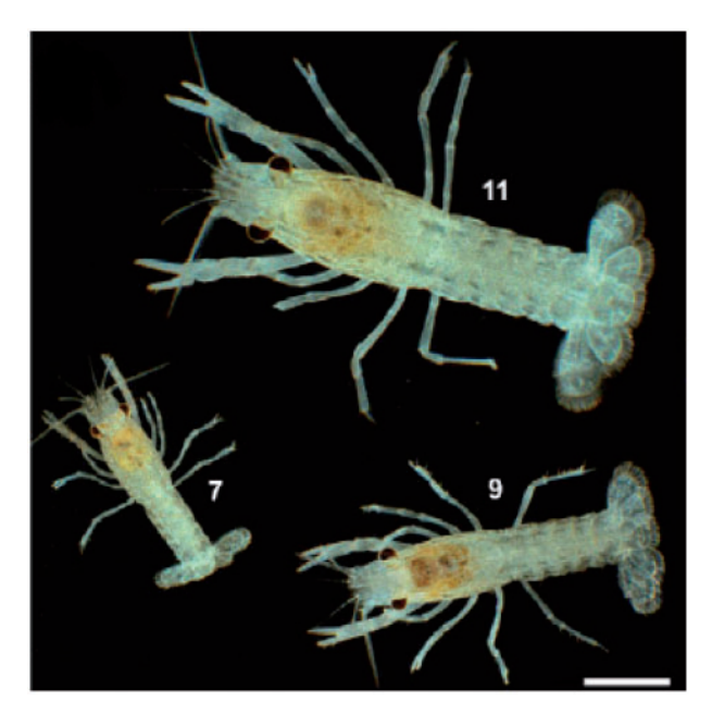
Figure 5 Variation of growth of genetically identical marbled crayfish in an aquarium: how well would epidemiologists be able to predict outcomes? P4

In model organism studies trait deviations due to developmental noise tend to be independent of one another, 104 reflecting the generally non-stable