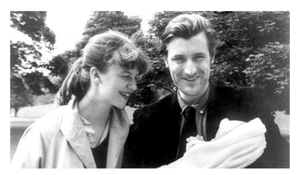
Figure 6 Sylvia Plath and Ted Hughes. In his poem about Plath's suicide, 'Last letter' Hughes wrote 'what happened that night ... is as unknown as if it never happened. What accumulation of your whole life, like effort unconscious, like birth pushing through the membrane of each slow second into the next, happened only as if it could not happen'<sup>207</sup>

contribution of smoking to the population burden of lung cancer that <10% of variance accounted for by cigarette smoking among individuals observed in prospective epidemiological studies, and the 12% shared environmental variance reported in Table 1, should be considered. The shared environmental component will in part reflect shared environmental differences in cigarette smoking initiation. The non-shared environmental component (62% of the variance in Table 1) will include the non-shared environmental influence on initiation, amount and persistence of smoking.<sup>144</sup> However, as discussed earlier, stable aspects of the non-shared environment—which smoking would tend to be-are generally small contributors to the total non-shared environmental effect, and thus much of this will also reflect the substantial contribution of the kinds of chance events-from the sub-cellular to the biographical—discussed above. Richard Doll, reflecting on the 50th anniversary of the publication of his classic paper with Peter Armitage on the multi-stage theory of carcinogenesis<sup>145</sup> considered that