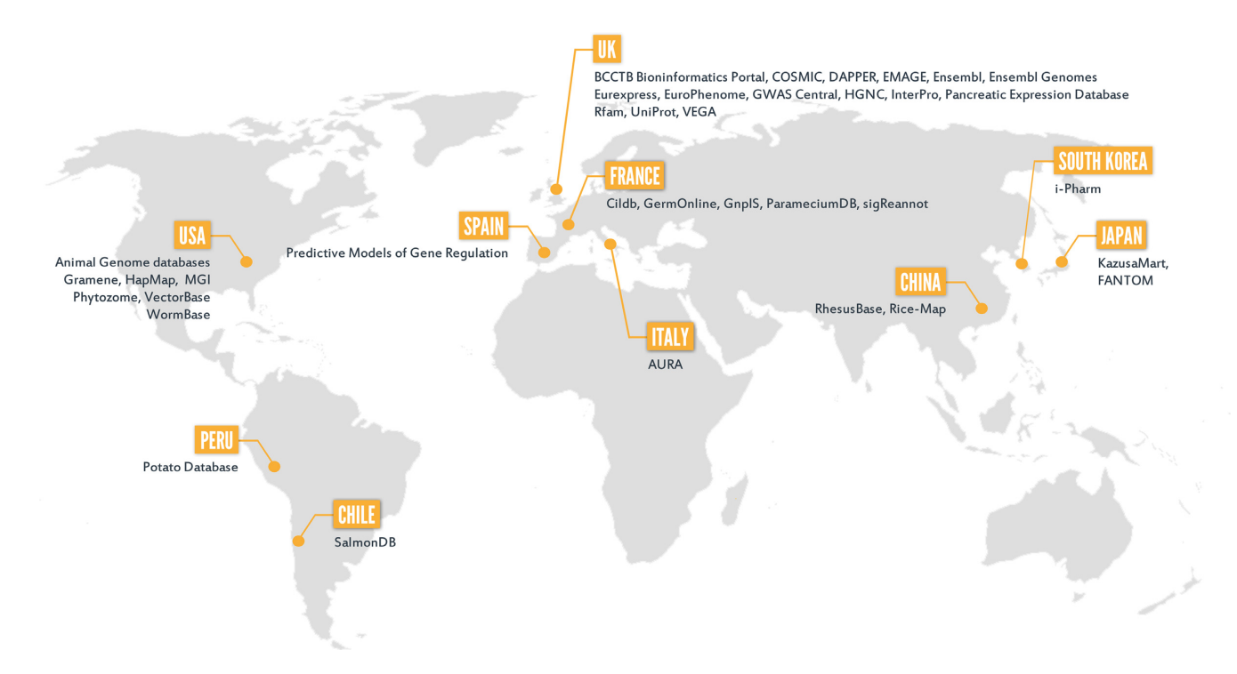
Figure 1. BioMart community databases and their host countries.

ing results from a few existing resources is challenging due to the lack of a complete, up to date catalogue of already existing resources and the necessity of constantly learning how to navigate new query interfaces. A different challenge is faced by collaborating groups of scientists who independently generate or maintain their own data. Such collaborations are seriously hampered by the lack of a simple data management solution that would make it possible to connect their disparate, geographically distributed data sources and present them in a uniform way to other scientists. The BioMart project has been set up to address these challenges.