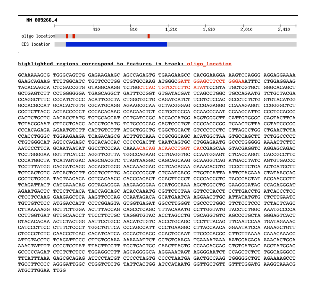
A screenshot of the results from a siRNA design visualization demonstrates how lwgv represents sequence features on tracks. In this case, the features of interest are the coding sequence (CDS) of the gene being used for RNAi and the location of the designed oligos on that CDS. lwgv also allows the sequence itself to be displayed and colored according to the information in the track.

and independence from a database backend facilitates the dynamic creation of genome views based on user-chosen analyses. lwgv allows "include" files, which provide an object-oriented, plug-n-play, architecture for managing tracks and building text files for more complex viewer applications. We have successfully used lwgv to visualize RNAi oligos on their corresponding genes [8], to present a linkage disequilibrium map of chromosome 19 [9], and to display feature annotations for the GeneSeer [10]. We also present a new application of lwgv to dynamically visualize changes in gene expression along a genome using any combination of the over 500 prokaryotic microarrays available in the Many Microbe Microarrays Database (M<sup>3D</sup>). lwgv is an ideal tool for the presentation of dynamic analyses and sequence annotations without resorting to the creation and maintenance of a large database and software infrastructure.