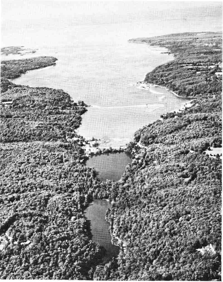
COLD SPRING HARBOR LOOKING NORTH TO CONNECTICUT