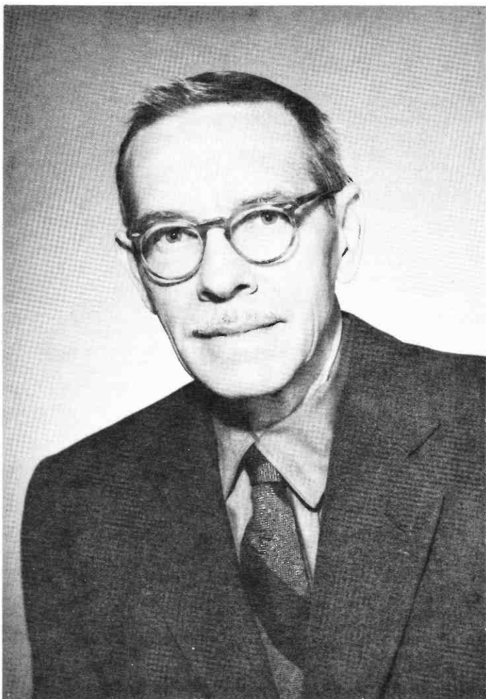
Alfred Day Hershey, Nobel Laureate – October, 1969