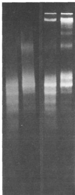
Figure 3. Polyacrylamide gel electrophoresis (6%) of DNA liberated upon digestion of metaphase chromosomes and interphase nuclei. Interphase nuclei and metaphase chromosomes were digested with staphylococcal nuclease. The resistant DNA was freed of protein and 10 \mu g applied to each slot of a 5% polyacrylamide gel. The gel was run as described previously, stained with ethidium bromide, and photographed. Samples from right to left represent 14 and 28% digestion of metaphase chromosomes and 10 and 30% digestion of nuclei

Attempts to assess the subunit structure of metaphase chromosomes require the preservation of this structure during the purification procedure and digestion. To test the possibility that rearrangement of chromosomal